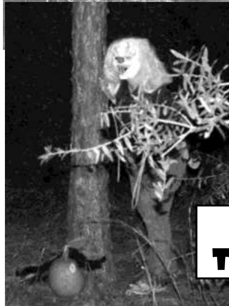
SCARY TRAIL RIDE